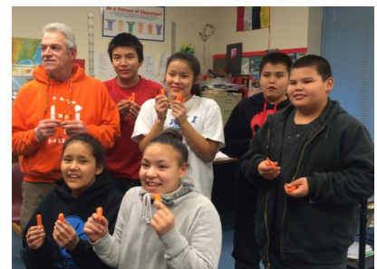
Above: Tebughna School students compare local and out of state carrots in a taste test.

2015 brings necessary garden expansions and improvements including using the field behind the high tunnels and implementing a drip irrigation system.