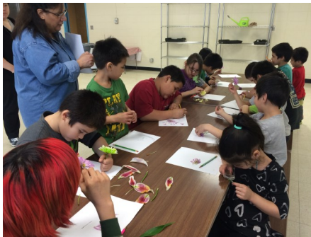
Above: Tebughna School students dissected flowers and learned about plant biology.

Over the past year, Tebughna School students have learned about the salmon life cycle, watershed ecology, plant biology, and planted and harvested local produce at the Tyonek Garden. Students also played a role