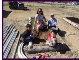
Left: Community planting day. Right: Solar array.