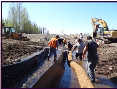
Above: Installing coir log along the new channel. Below: Completed revegetation work at site.