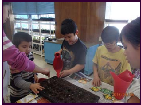
Students in the Tebughna School planting vegetable starts for the Tyonek Garden 2013 season.

The Native Village of Tyonek, the Tyonek Tribal Conservation District, and the Tebughna School are once again partnering for another year of working together on the Tyonek Community Garden—and we have big plans for 2013!