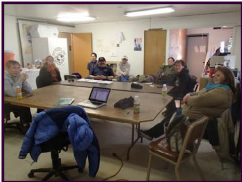
Above: Mtn Village TCD Board meeting with TTCD. Below: Kwethluk joint meeting with TTCD.